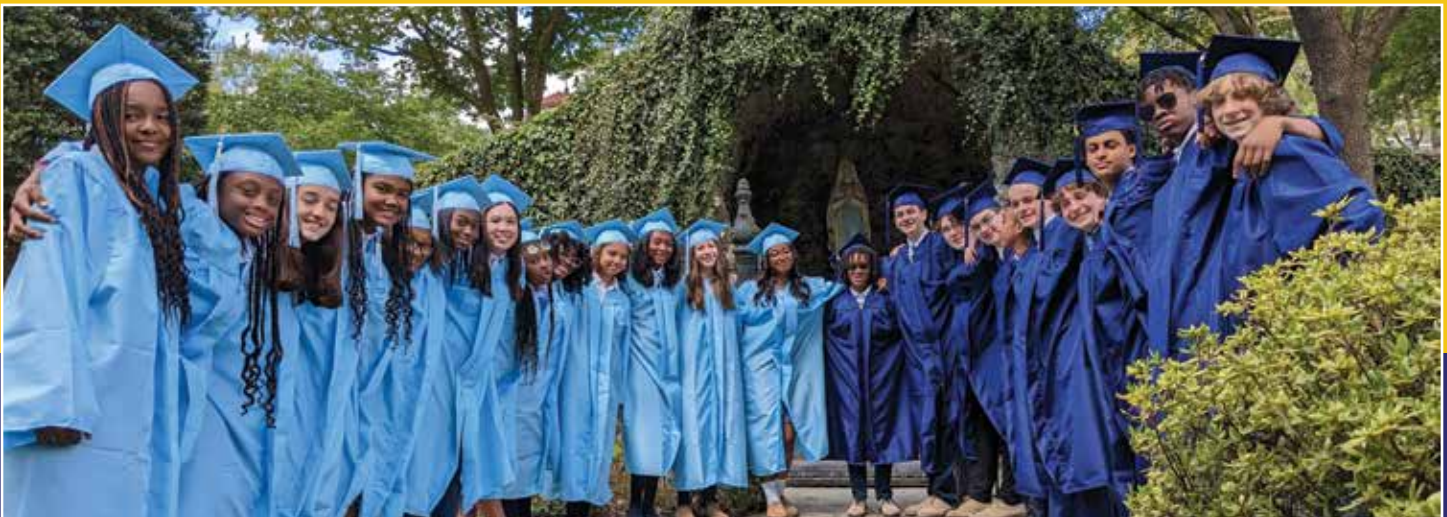
The Class of 2023 at Chestnut Hill College's Campus Grotto.