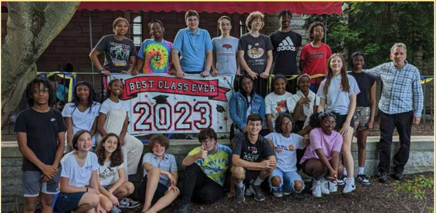
Graduates at the Eighth Grade Picnic.