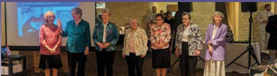
The Sisters of Saint Joseph being recognized by the OMC community for their Hall of Fame Induction.

OMC's $160,000 for 160 Campaign ended in a resounding success!